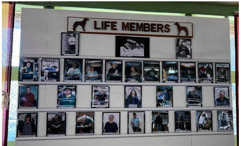
Right: The Life Members board has been unveiled in the Clubrooms. The board is a fitting tribute to the volunteers of our Club, providing their time over many years.